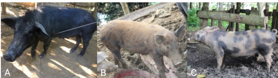
Figure 3. The native pigs in Bohol Island, Philippines showing plain (A), spotted (B), and patchy (C) color patterns

This study is limited only to the observation of the phenotypic characteristics of native pigs in Bohol, thus molecular differentiation of native pig breeds is still unknown. Mixing local breeds was a common practice with most domesticated animals before either reproductive isolation started or humans began to confine them to protect against extinction and recognize their importance. In the Philippines, native/wild pigs were probably allowed to roam freely in the locality and could have bred with domestic pigs. The gene flow was asymmetrical, basically more modern breed genome flew into the native stock; thus, non-behavioral traits such as color pattern mixture of native and modern pig breeds have been observed.