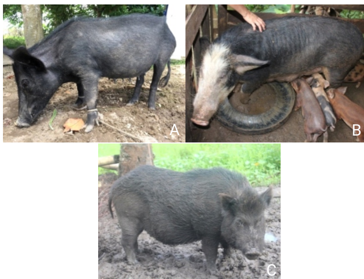
Figure 1. The predominant hair and coat color characteristics of native pigs in Bohol Island, Philippines: black colored (A), black with white patches in the forehead (B), and black of the wild pig (C)

domestic animals are the result of relatively recent human-mediated selection. Under farm conditions, there is a selection pressure by the native pig raisers who are forced to select the pure black color as the most important criterion/standard to qualify their stocks as native. Consumers, especially the health-conscious, choose pigs which are considered organically grown. They usually associate this with the black color of the pig's hair and coat.