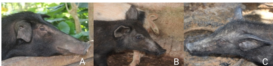
Figure 4. The native pigs in Bohol Island, Philippines showing droopy (A), slightly droopy (B), and erect (C) ear orientation

In terms of ear orientation, 54% of the native pigs in Bohol had droopy, 37% had slightly droopy, and 9% had erect ears (Table 1). The droopy ear orientation was observed to be highest (90%) in the municipality of San Miguel, while a high percentage (60%) of Alburquerque and Guindulman pigs had slightly droopy ears. Almost a third (30%) of pigs in Bilar and Guindulman had erect ears (Figure 4). These findings are contrary to Yaetsu et al (1987) who reported that erect ears were common among native pigs in different regions of Bangladesh. However, some of the native pig breeds in other countries such as Taihu and Meishan pigs in China and Large Black pigs from Australia also exhibit drooping ears (The Pig Site 2013). Subalini et al (2010) reported that village pigs could have droopy ears as well, but majority (77%) had erect ears. It is interesting to note that only 9% of the native pigs in Bohol exhibited erect ears.